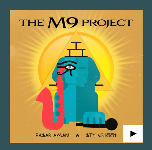
The M9 Project

The first and second single off the "The M9 Project" are available now on Bandcamp for early preview. The full album will be available on all platforms on 11/17/22. Please click on the below link to preview the singles.